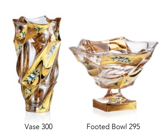
Footed Bowl 295