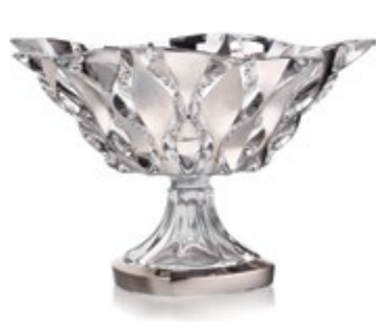
Footed Shallow Bowl 350