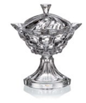
Footed Cov. Box 250