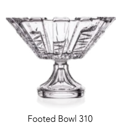
Footed Bowl 310 Vase 305