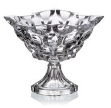
Footed Bowl 305