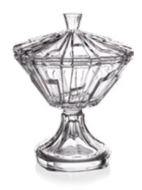
Footed Cov. Box 250