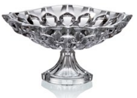
Footed Shallow Bowl 350