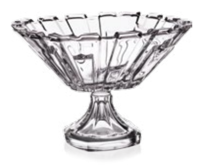
Footed Bowl 310